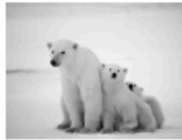
A polar bear and its cubs.

Have you ever wondered about polar bears? If so, this report will tell you everything you need to know. Polar bears are the kings of the Arctic. Read on to find out more.